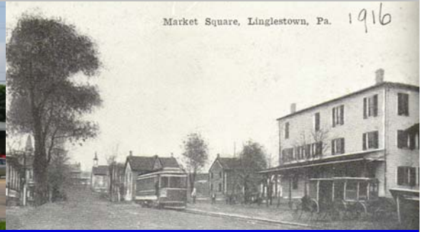
Linglestown was formed in the 1700's around a central public square.