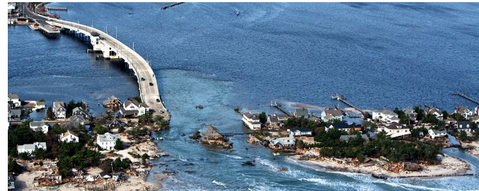
2012 Superstorm Sandy, Mantoloking, NJ