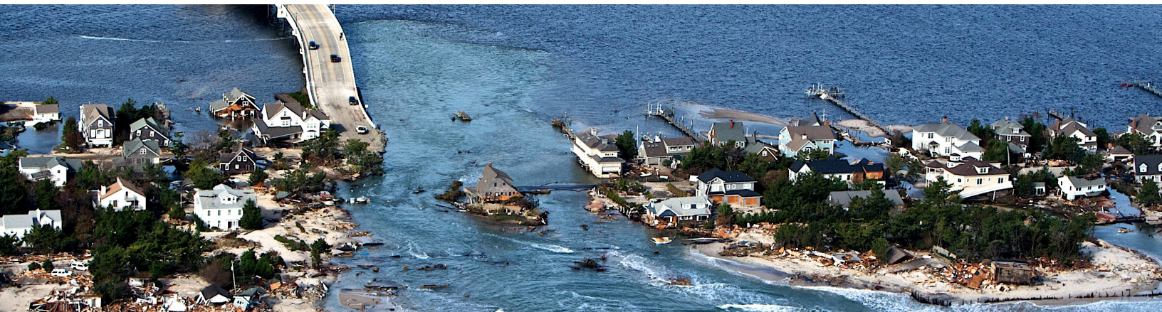
2012 Superstorm Sandy, Mantoloking, NJ